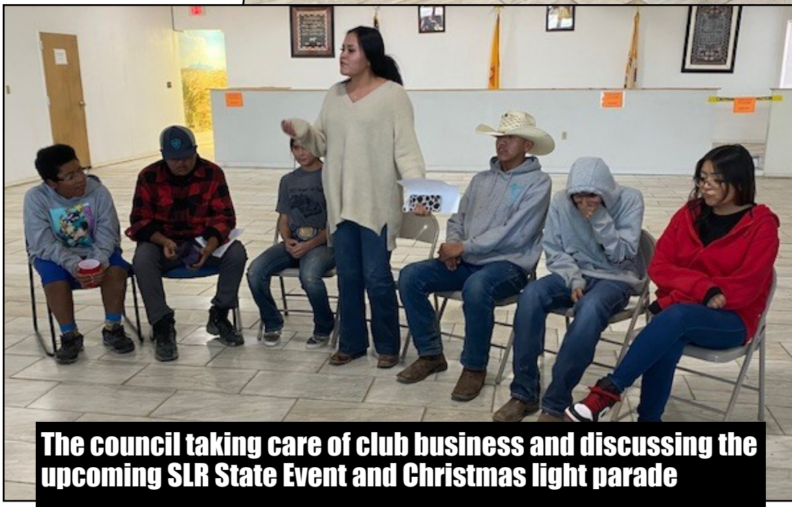
The council taking care of club business and discussing the upcoming SLR State Event and Christmas light parade