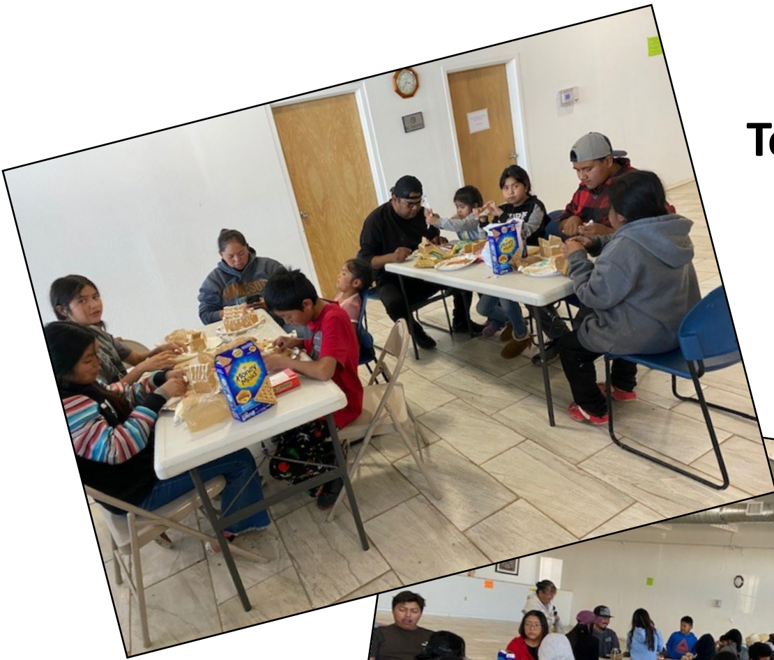
Working on Gingerbread Houses and preparing food gift baskets for the elderly and homebound.