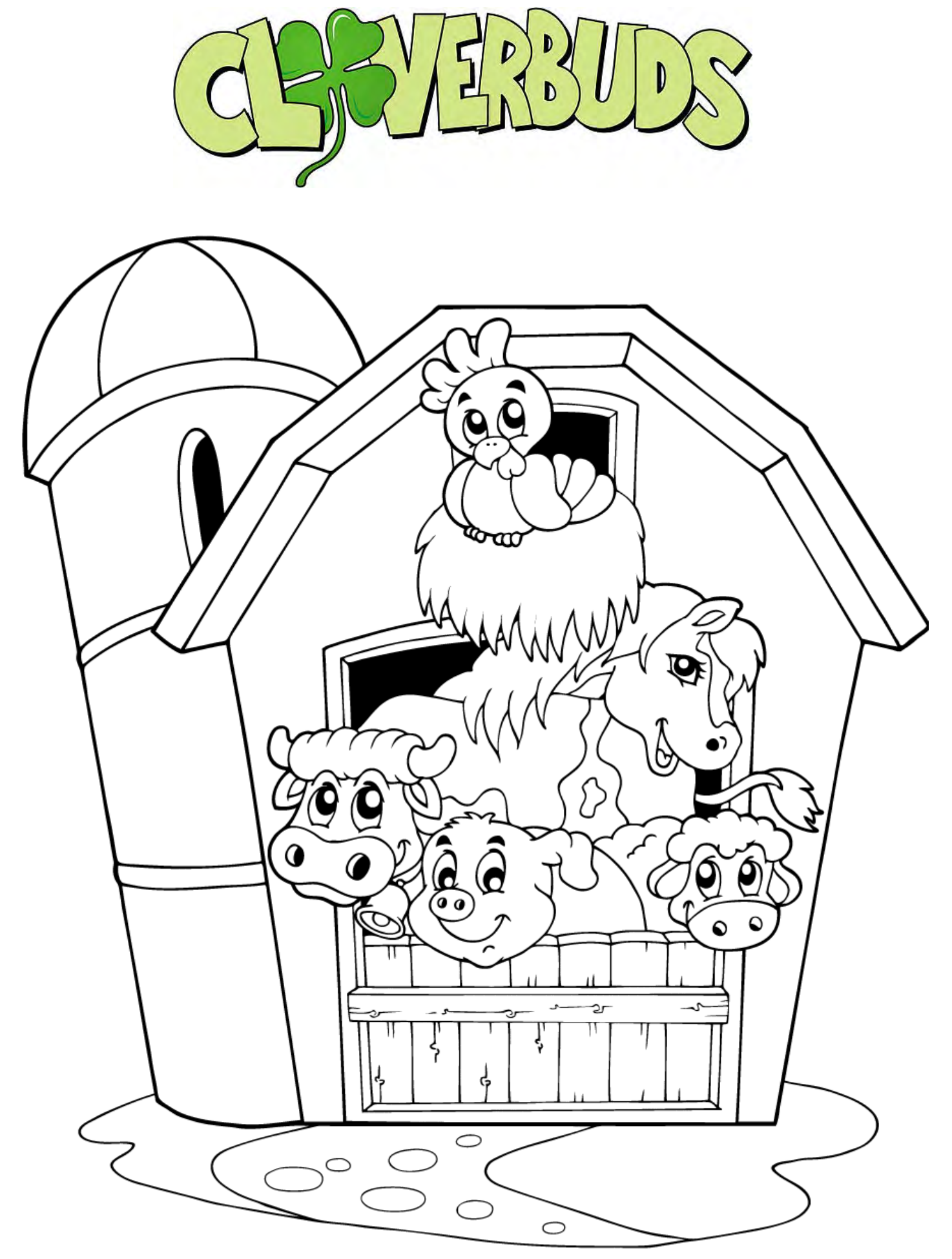
Can you color the Barn & Animals?