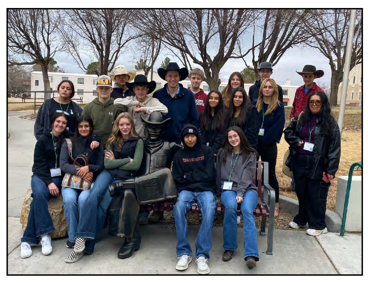
Thank you Commissioners!