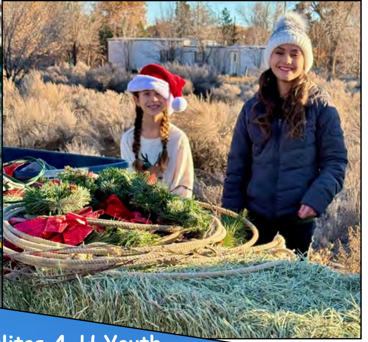
Corralitos 4-H Youth Decorating their awesome float for the Parade