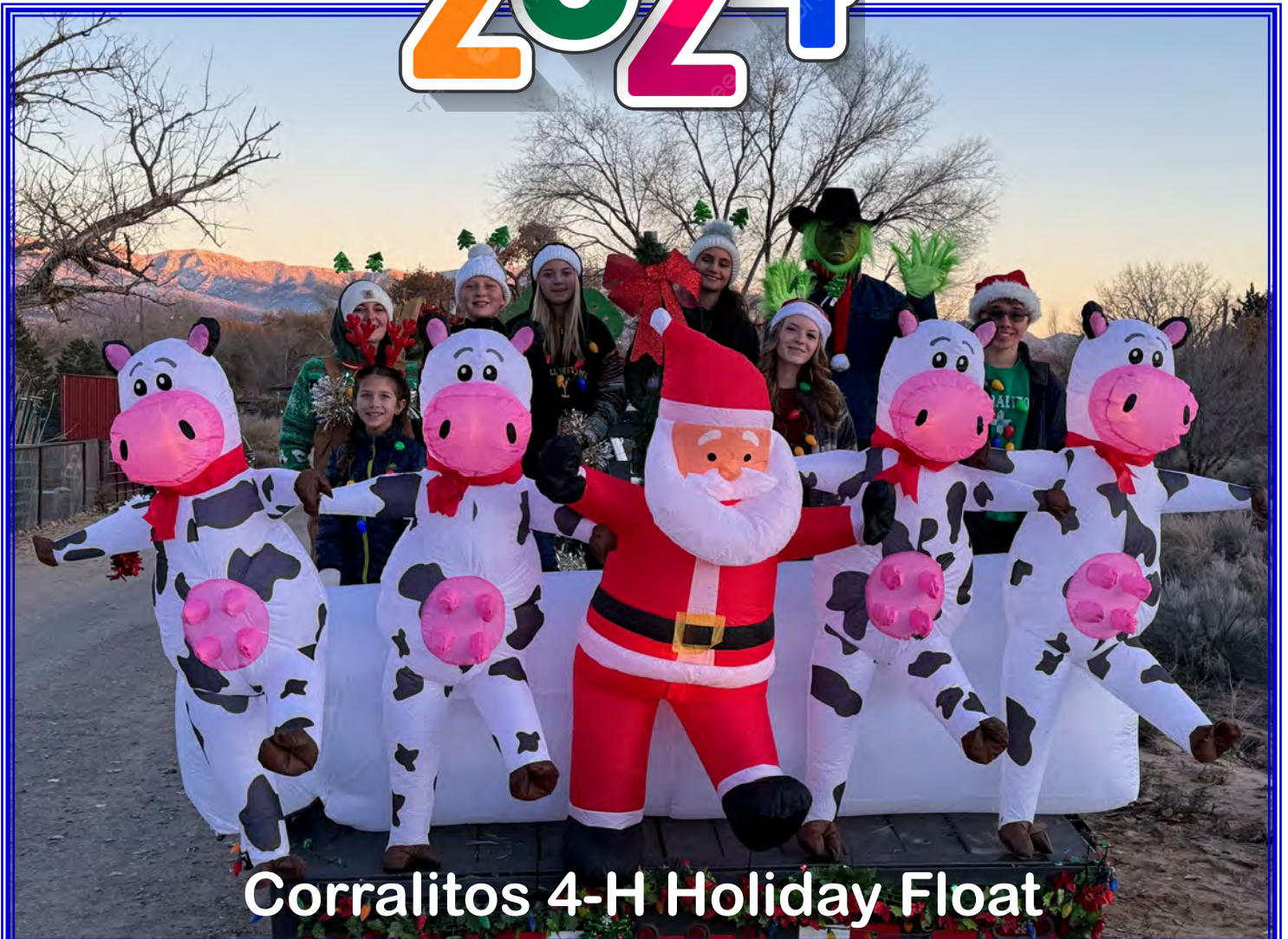
Corralitos 4-H Holiday Float

New Mexico State University is an equal opportunity/affirmative action employer and educator. NMSU and the US Department of Agriculture cooperating.