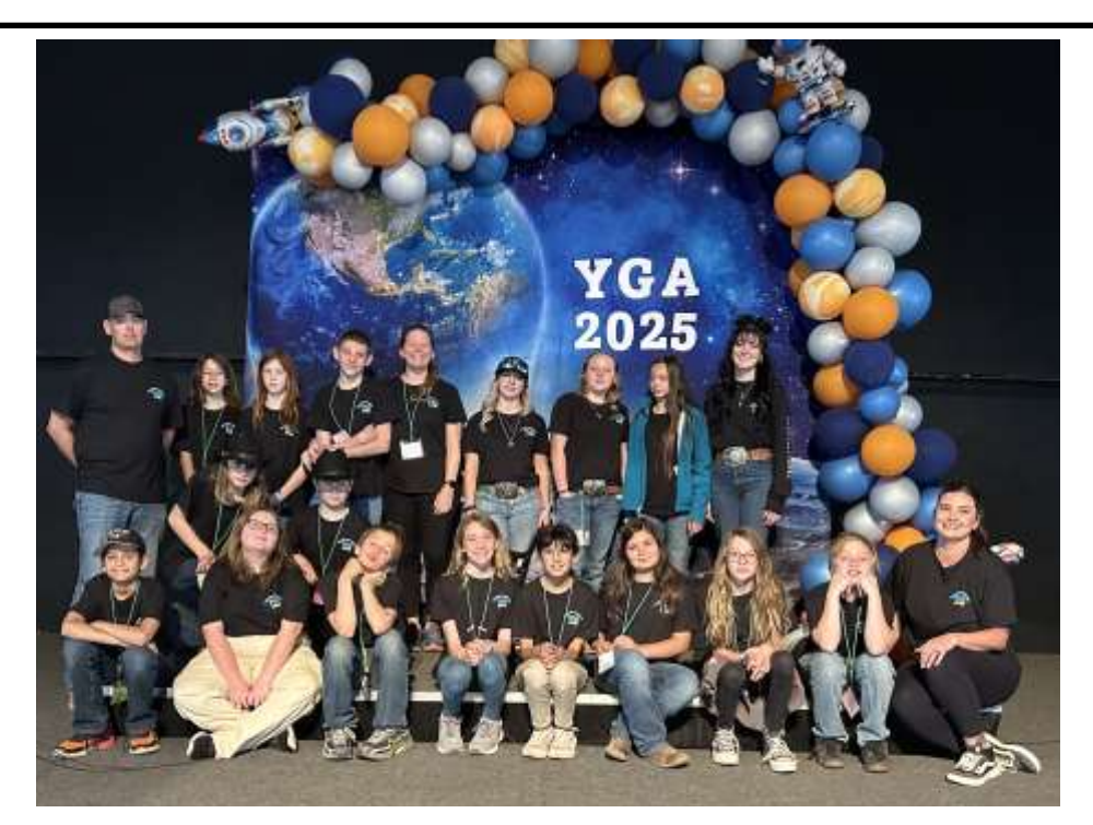
Youth Get Away—Awesome Sandoval County 4-H'ers!